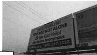
Example of Billboard Design